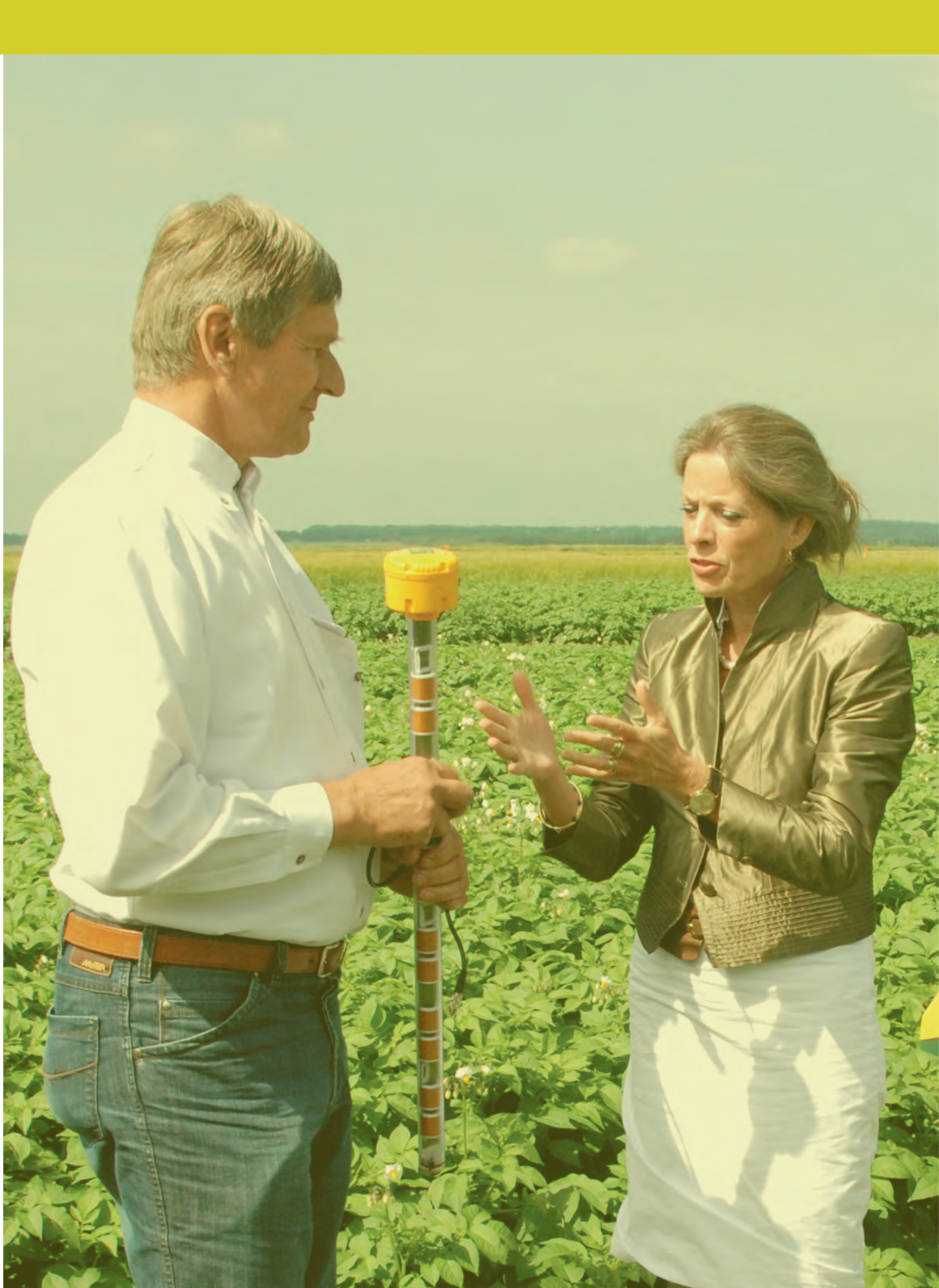
Soil moisture sensors inform when to irrigate